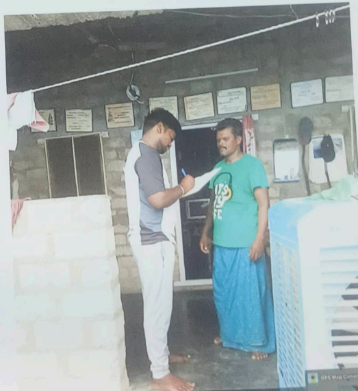
Savalyapuram, Andhra Pradesh, India 4R48+828, Savalyapuram, Andhra Pradesh 522646, India Lat 16.105681° Long 79.814371° 03/06/22 05:10 PM