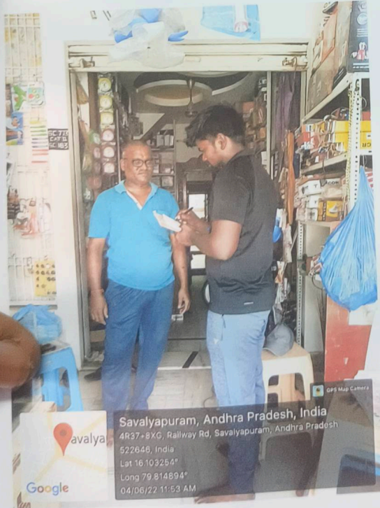
Savalyapuram, Andhra Pradesh, India 4R37+8XG, Railway Rd, Savalyapuram, Andhra Pradesh 522646, India Lat 16.103254° Long 79.814894° 04/06/22 11:53 AM