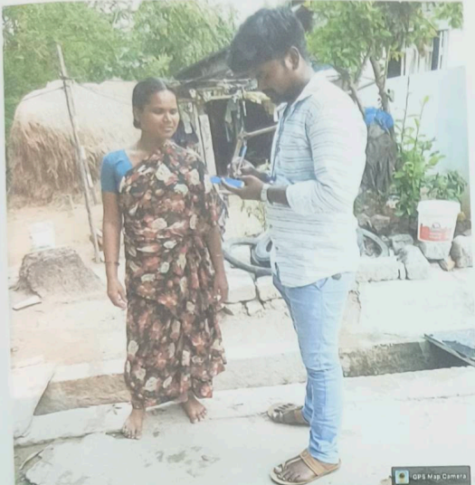
Savalyapuram, Andhra Pradesh, India 4R48+828, Savalyapuram, Andhra Pradesh 522646, India Lat 16.105692° Long 79.814502° 07/06/22 05:32 PM